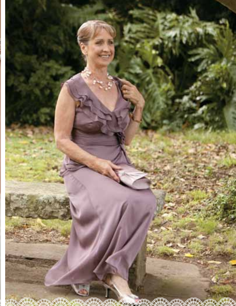
Top Left > Swarovski Crystal Necklace by Crystal Confetti Bridal (pg 10), Bridal Gown by Lynette Fing Boutique (pg 95). Top Right > Mother of the Bride Outfit by Shazzam Formal Wear (pg 97), Pearl Necklace by Shazzam Formal Wear (pg 97), Purple Satin Clutch & Shoes by Charlestown Boutique (pg 96). Bottom Left > Men's Grey Suit by Shazzam Formal Wear (pg 97), Dress by Lynette Fing Boutique (pg 95), Necklace by Citi Centre Showcase Jewellers (pg 105). Bottom Right > Suit & Tie by Shazzam Formal Wear (pg 97), Rose Buttonhole by Amaranthine Flowers By Design (pg 163), Men's Ring by Citi Centre Showcase Jewellers (pg 105). Opposite Page > Bridal Gown by Lynette Fing Boutique (pg 95), Swarovski Crystal Necklace & Earrings, by Crystal Confetti Bridal (pg 10), Men's Grey Suit by Rundle Tailoring (pg 94).