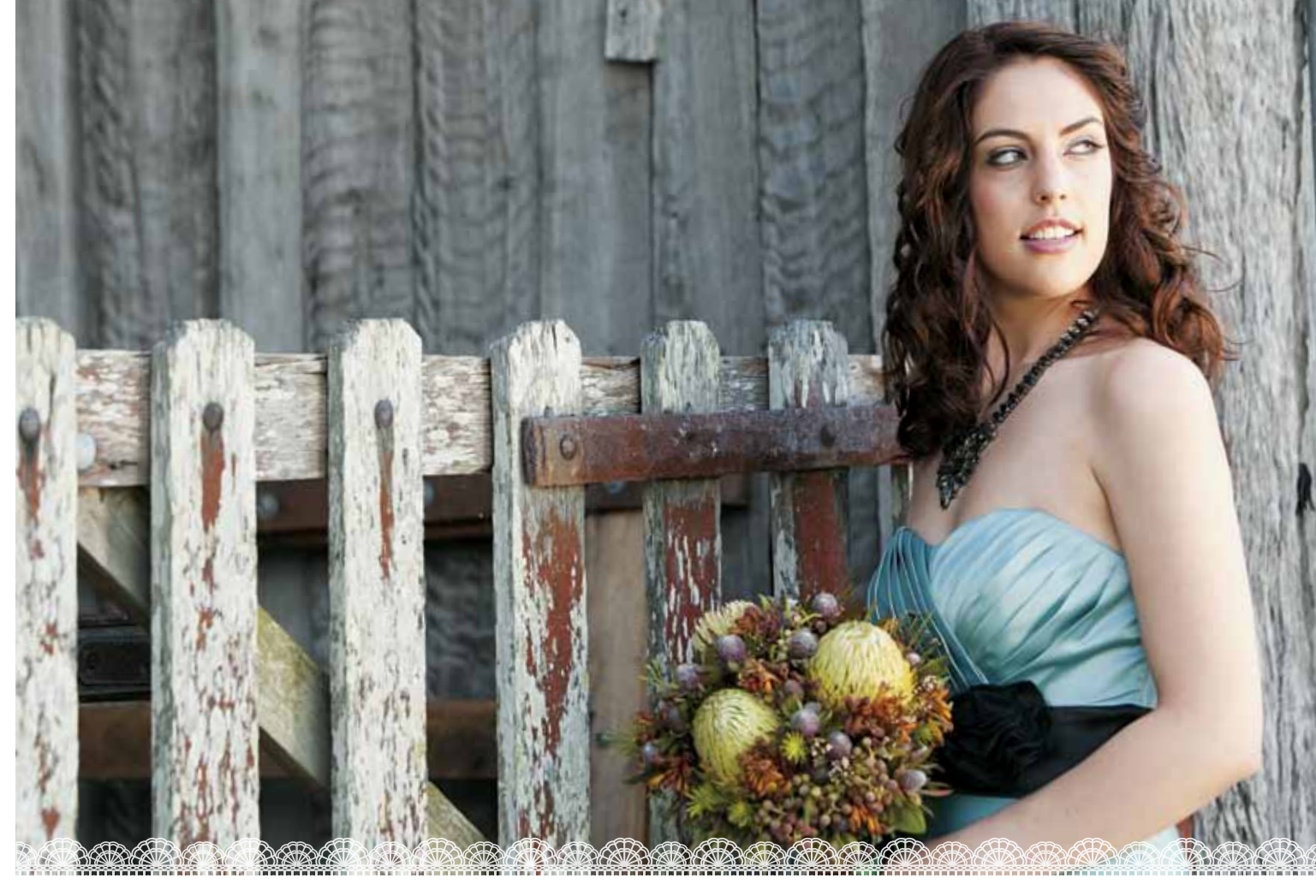
Top > Green Silk Dress with Black Sash by Bombshell Boutique (pg 99), Necklace by Lovisa, Westfield Kotara, Native Floral Bouquet by The Florist & Wedding Specialists (pg 163). Bottom Left > Bridal Gown by Brides of Sydney (pg 98), Crystal Headband by Shazzam Formal Wear (pg 97), Earrings by Crystal Confetti Bridal (pg 10). Bottom Right > Mother of the Bride Outfit & Pearl Earrings by Charlestown Boutique (pg 96). Opposite Page > Bridal Gown by Brides of Sydney (pg 98), Pearl and Crystal Earrings by Crystal Confetti Bridal (pg 10), Purple Shoes by Charlestown Boutique (pg 96), Pearl & Diamante Bracelet by www.gartergirl.com.au.