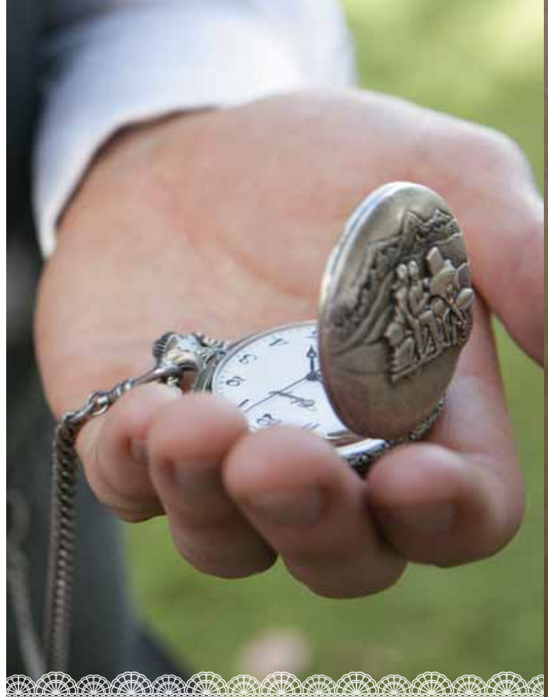
Top Left > Glow in the Dark Lingerie by Luminoglow Lingerie (pg 93), Veil by Brides of Sydney (pg 98). Top Right > Men's Fob Watch by Citi Centre Showcase Jewellers (pg 105). Bottom Left > Pearl & Crystal Headband by Shazzam Formal Wear (pg 97), Wedding Rings by Secrets Shhh - Kotara (pg 104), Bridal Gown by Shazzam Formal Wear (pg 97). Bottom Right > Glow in the Dark Lingerie by Luminoglow Lingerie (pg 93), Veil by Brides of Sydney (pg 98). Opposite Page > Bridal Gown by Shazzam Formal Wear (pg 97), Pearl & Crystal Headband by Shazzam Formal Wear (pg 97).