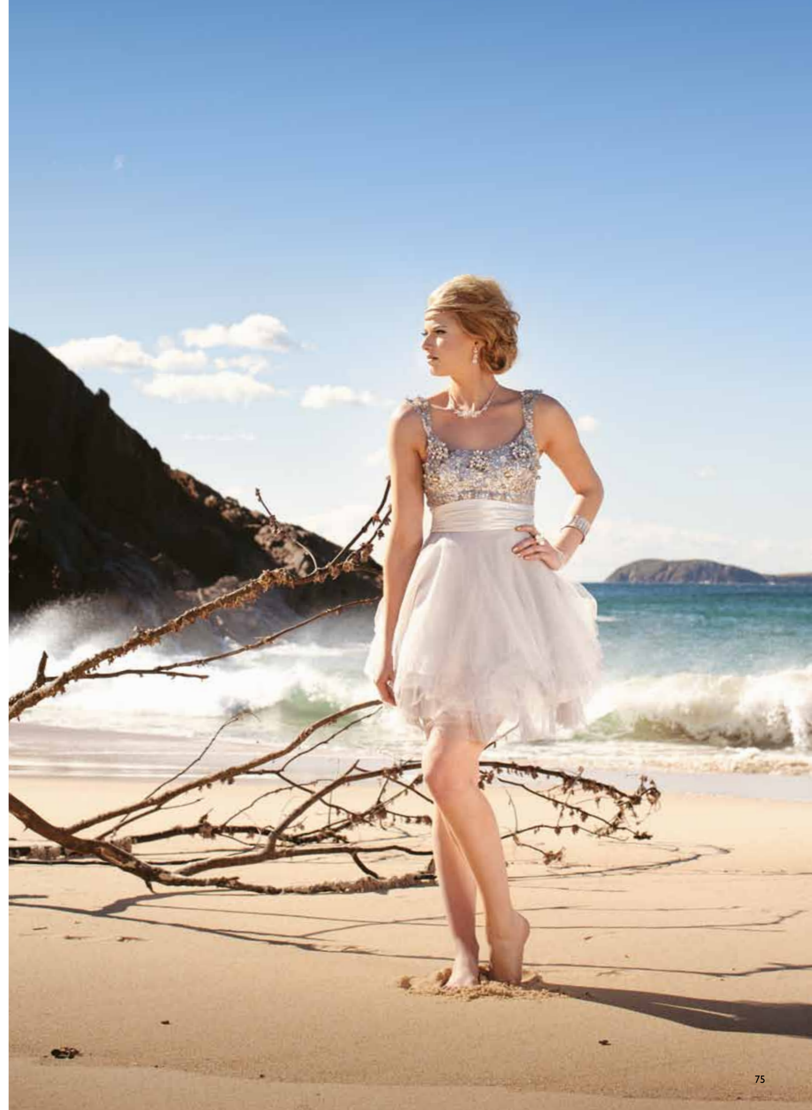
RIGHT PAGE > Silver Beaded & Tulle Dress by Its All About Fashion (pg 95), Crystal Necklace & Matching Earrings by Fletcher & Grace (pg 99), Bracelets by Danusia Fashion Jewellery & Accessories (pg 100), Ring by Crystal Confetti Bridal (pg 11).