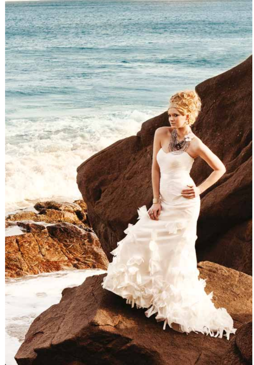
LEFT PAGE > Men's Suit, Tie & Shoes by Rundle Tailoring (pg 91), Men's Ring by Mayfair Jewellers (pg 99), Bridal Gown by Its All About Fashion (pg 95), Silver Hoop Earrings by Citi Centre Showcase Jewellers (pg 101), Silver Necklace by Peter O'Neill Jewellery (pg 101).