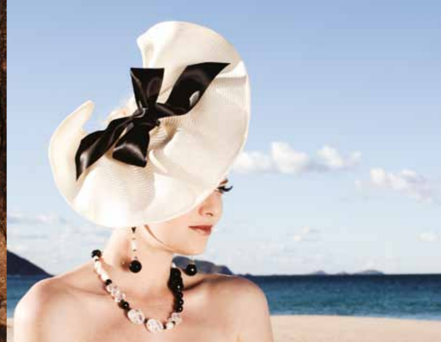
CLOCKWISE FROM TOP LEFT > Pearl & Crystal Necklace by Crystal Confetti Bridal (pg 11), Gold Pearl Bracelets by Danusia Fashion Jewellery & Accessories (pg 100), Round Crystal Bracelet by Williams the Jewellers at The Junction (pg 98), Bridal Gown by Vellos Bridal (pg 95). Glow in the Dark Lingerie by Luminoglow Lingerie (pg 93), Silver & Black Drop Necklace by Bombshell Boutique (pg 95), Square Hoop Earrings by Peter O'Neill Jewellery (pg 101), Black & Grey Crystal Bracelet by Williams the Jewellers at The Junction (pg 98), Ring by Citi Centre Showcase Jewellers (pg 101). Headpiece by Danica Erard Millinery (tel. 0414 776 505).