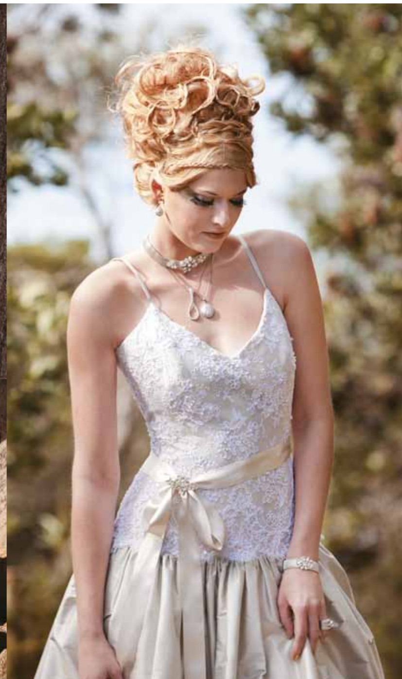
CLOCKWISE FROM LEFT > Short Purple Ruffle Dress by My Oasis Coffee & Clothing (pg 94), Black & White Spotted Headpiece by Danica Erard Millinery (tel. 0414 776 505), Plain Black Beaded Necklace by Williams the Jewellers at The Junction (pg 98), Black Bead and Crystal Necklaces, Earrings & Bracelet by Jewellery by Margo (tel. 0439 469 959), Purple Ice Watch by Mayfair Jewellers (pg 99). Crystal, Pearl and Net Hair Comb & Ring by Crystal Confetti Bridal (pg 11). Floral Hair Comb by Danusia Fashion Jewellery & Accessories (pg 100), Bracelet by Secrets Shhh - Kotara (pg 100).