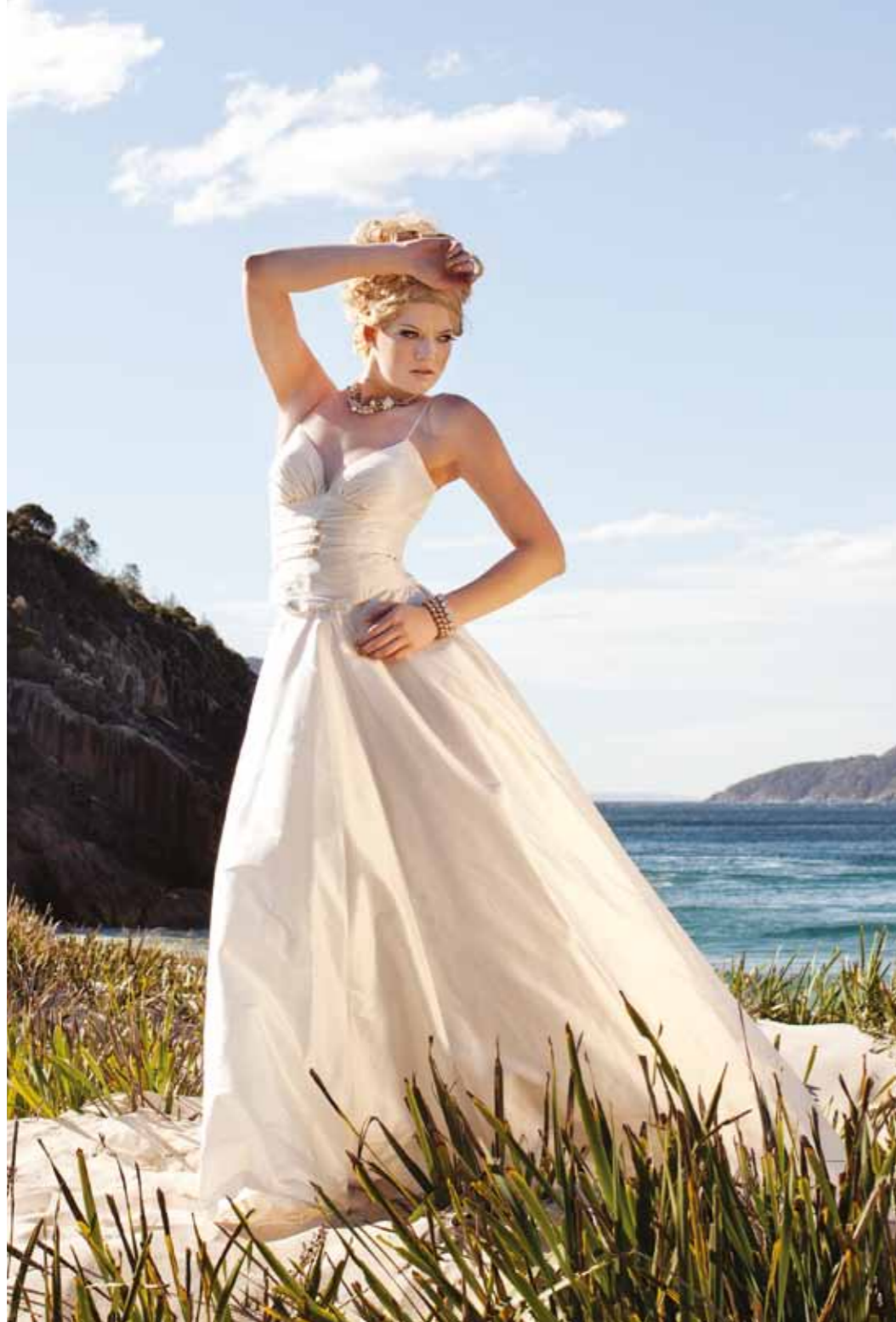
THIS PAGE > Bridal Gown by Vellos Bridal (pg 95), Pearl & Crystal Necklace by Crystal Confetti Bridal (pg 11), Gold Pearl Bracelets by Danusia Fashion Jewellery & Accessories (pg 100), Round Crystal Bracelet by Williams the Jewellers at The Junction (pg 98).