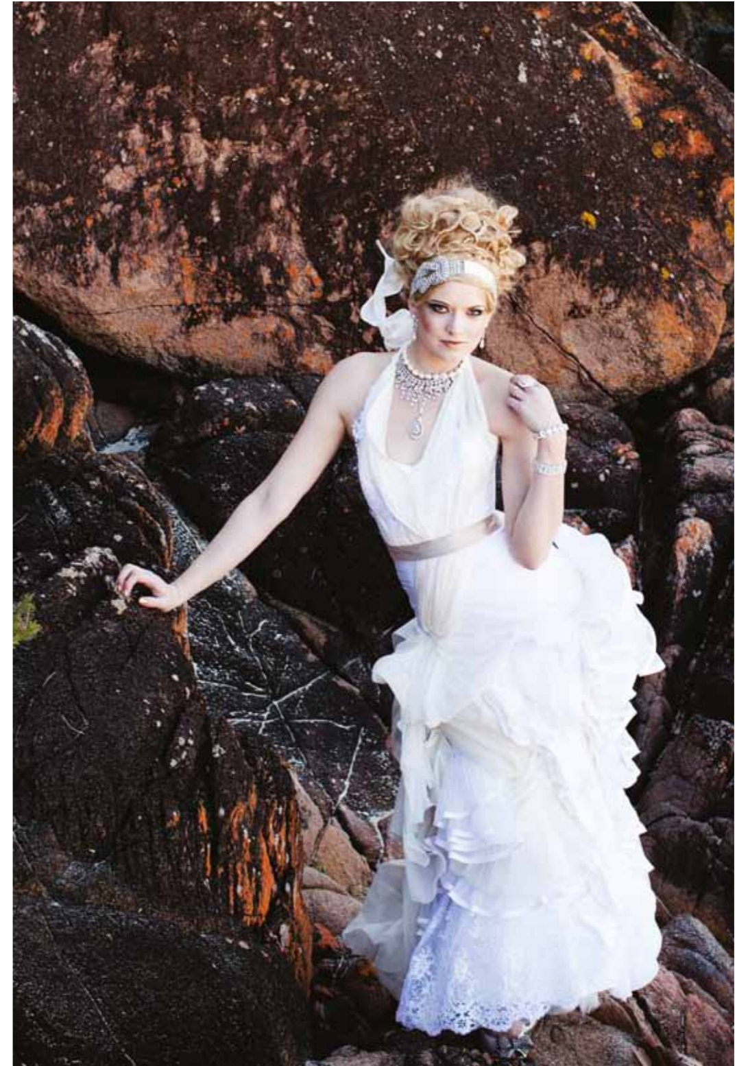
LEFT PAGE > Bridal Gown by Calèche Bridal House (pg 92), Tassel Necklace by Citi Centre Showcase Jewellers (pg 101), Black Round Necklace & Bracelet by Citi Centre Showcase Jewellers (pg 101), Silver Hoop Earrings & Rings by Peter O'Neill Jewellery (pg 101).