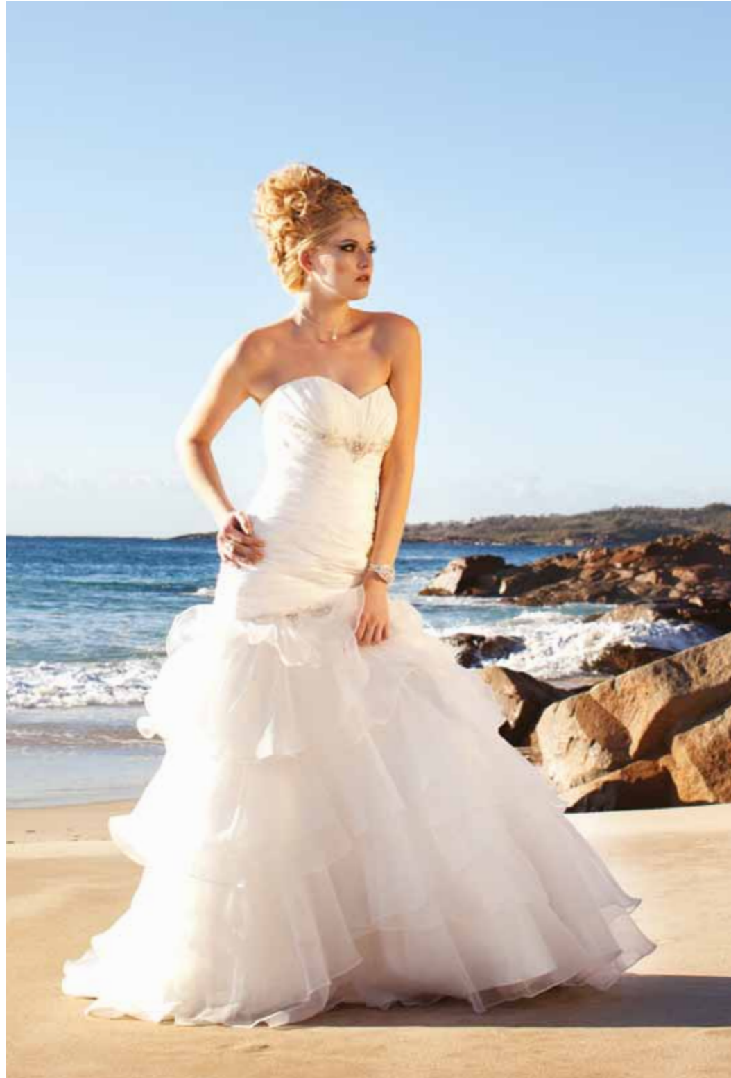
THIS PAGE > Bridal Gown by Shazzam Formal Wear (pg 90), Pearl Drop Necklace & Matching Earrings by Secrets Shhh - Kotara (pg 100), Crystal Ring & Cuff by Crystal Confetti Bridal (pg 11).