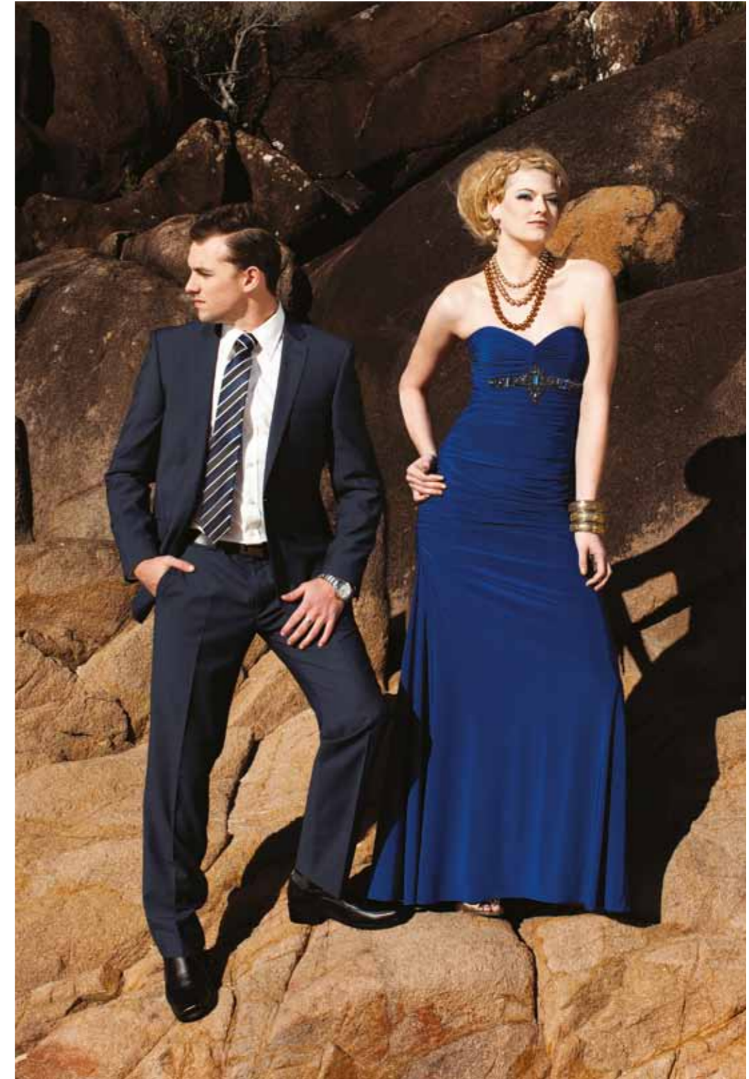
LEFT PAGE > Bridal Gown by Bombshell Boutique (pg 95), Necklace & Earrings by My Oasis Coffee & Clothing (pg 94), Silver Cuff & Silver Ring by Peter O'Neill Jewellery (pg 101), Silver & Blue Stone Ring by Citi Centre Showcase Jewellers (pg 101).