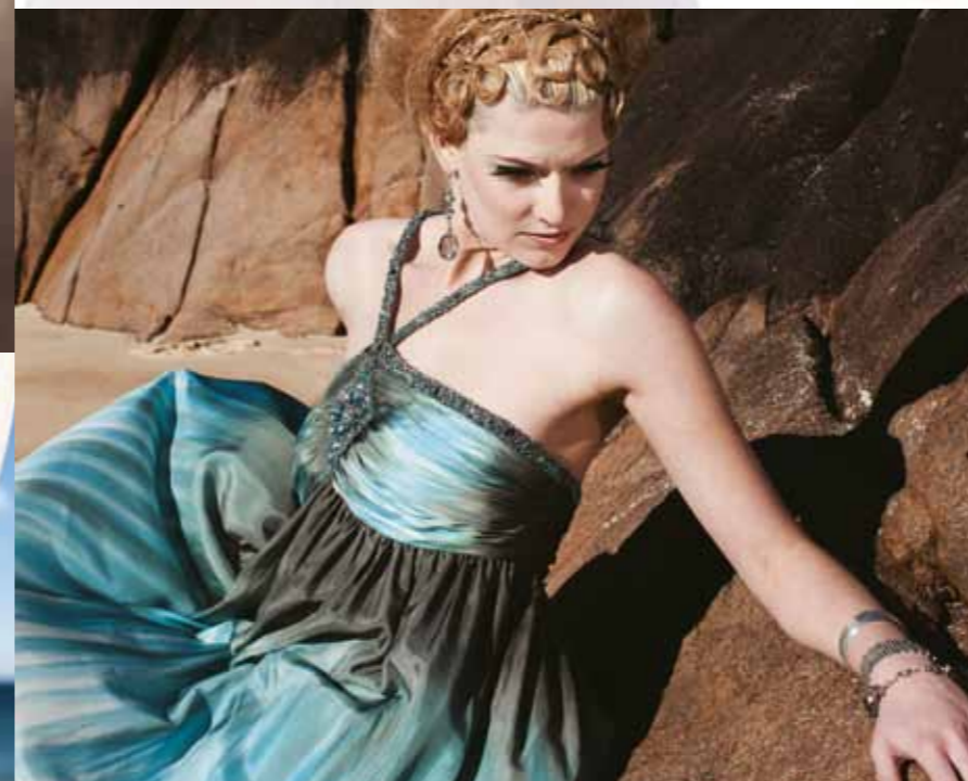
CLOCKWISE FROM TOP LEFT > Headpiece by Danica Erard Millinery (tel. 0414 776 505), Chandelier Earrings by Williams the Jewellers at The Junction (pg 98). Dress with Jewelled Detail by My Oasis Coffee & Clothing (pg 94), Cuff by Shazzam Formal Wear (pg 90). Brooch Bouquet by Crystal Confetti Bridal (pg 11). Men's Suit & Tie by Rundle Tailoring (pg 91).